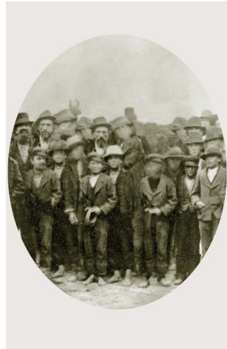
Water Street Bridge 2005 Ektachrome print 6" x 3.8" Edition of 10