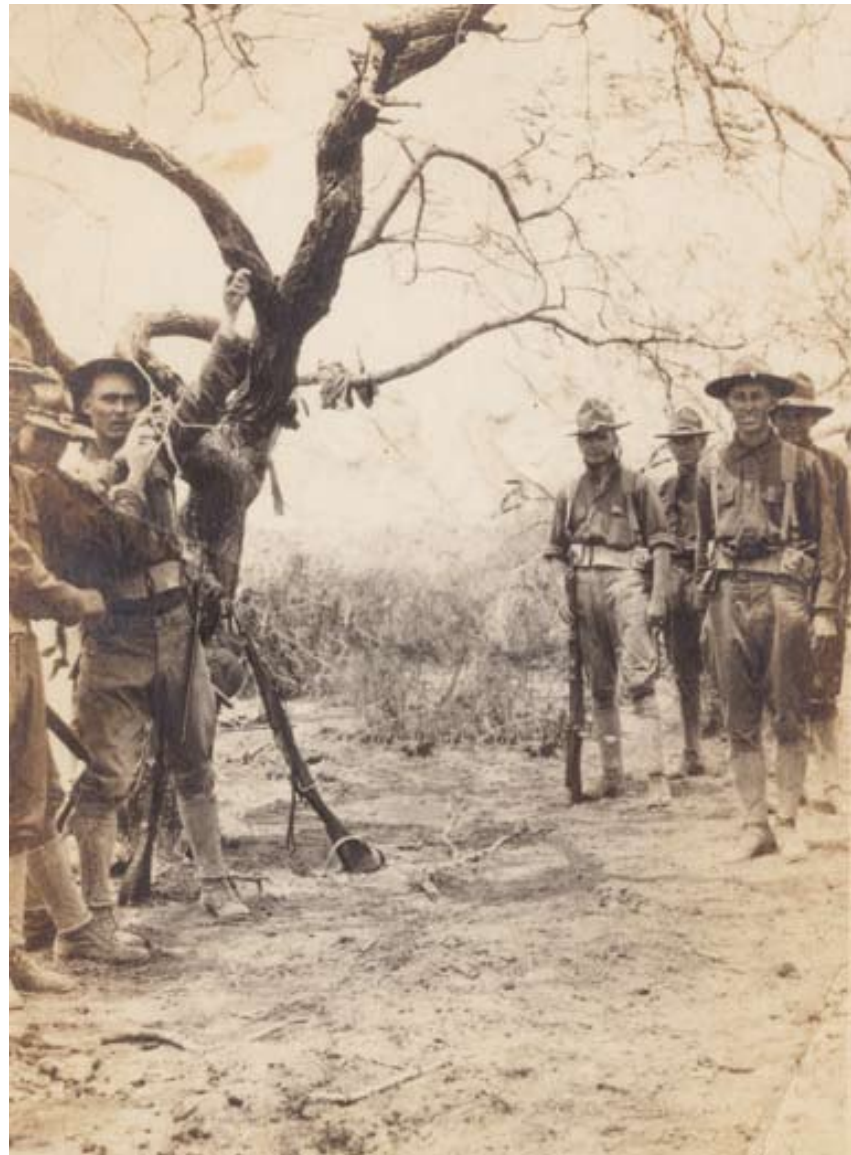
Disguised Bandit 2005 Ektachrome print 6" x 3.8" Edition of 10