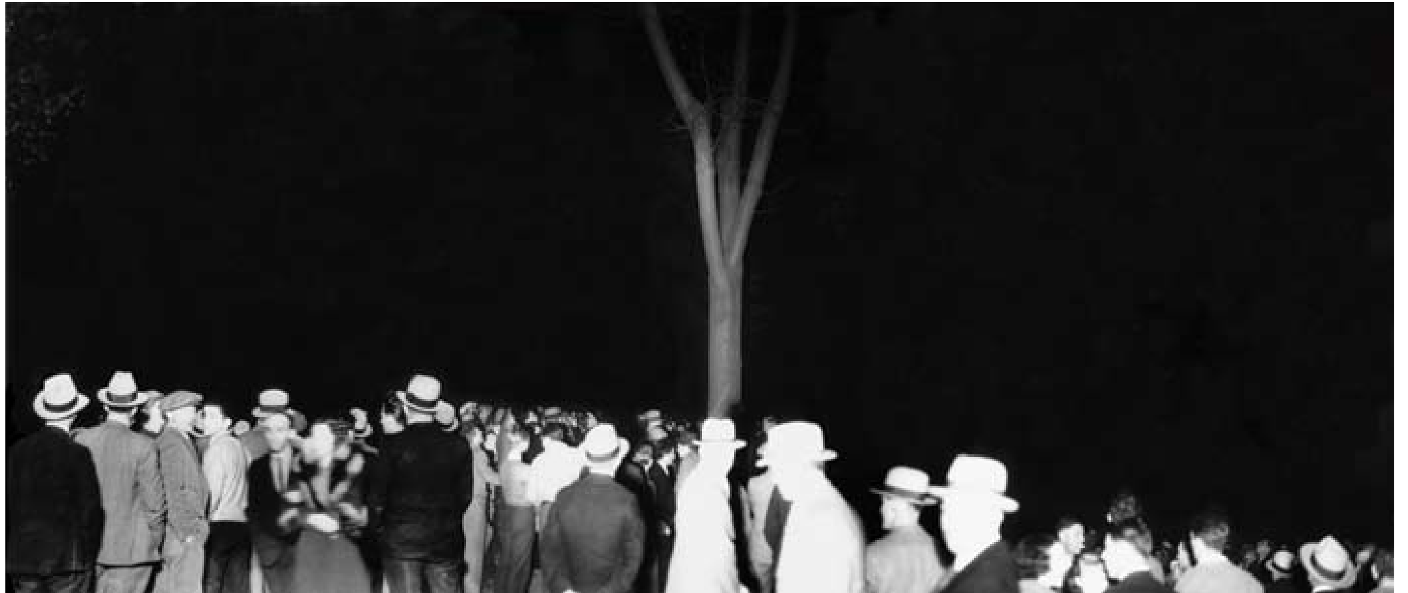
St. James Park

2006 Inkjet on vinyl 120" x 280" Unique print