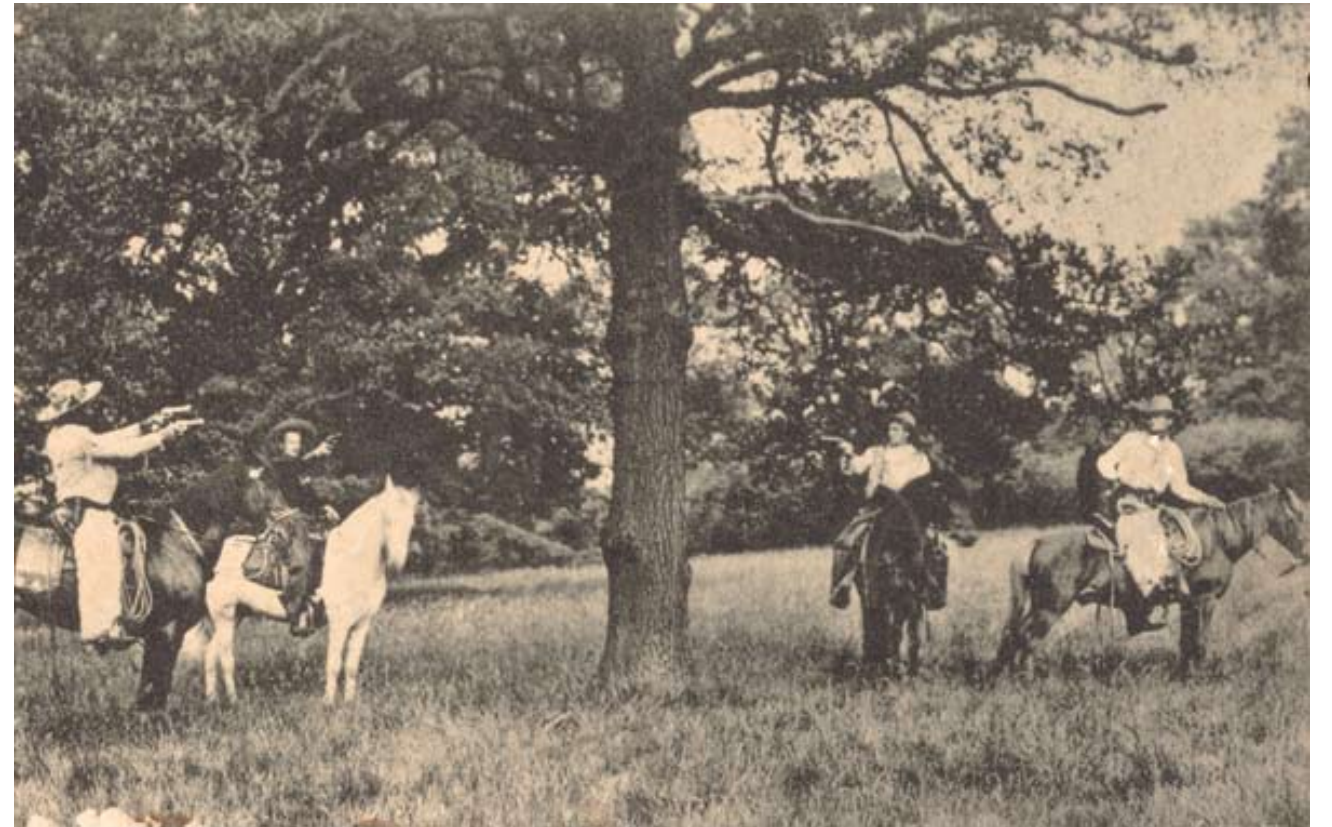
Der Wild West 2005 Ektachrome print 3.7" x 6" Edition of 10