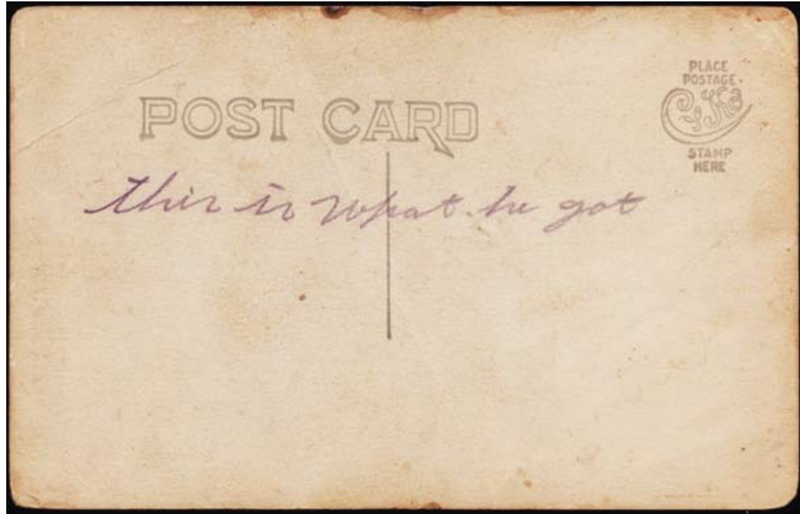
This is What He Got

2004 Ektachrome print 3.7" x 6" Edition of 10