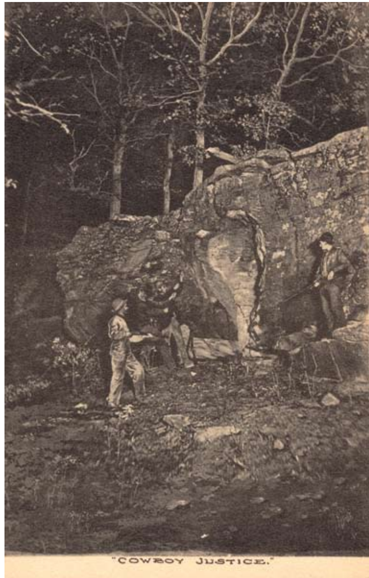
Cowboy Justice 2005 Ektachrome print 6" x 3.8" Edition of 10