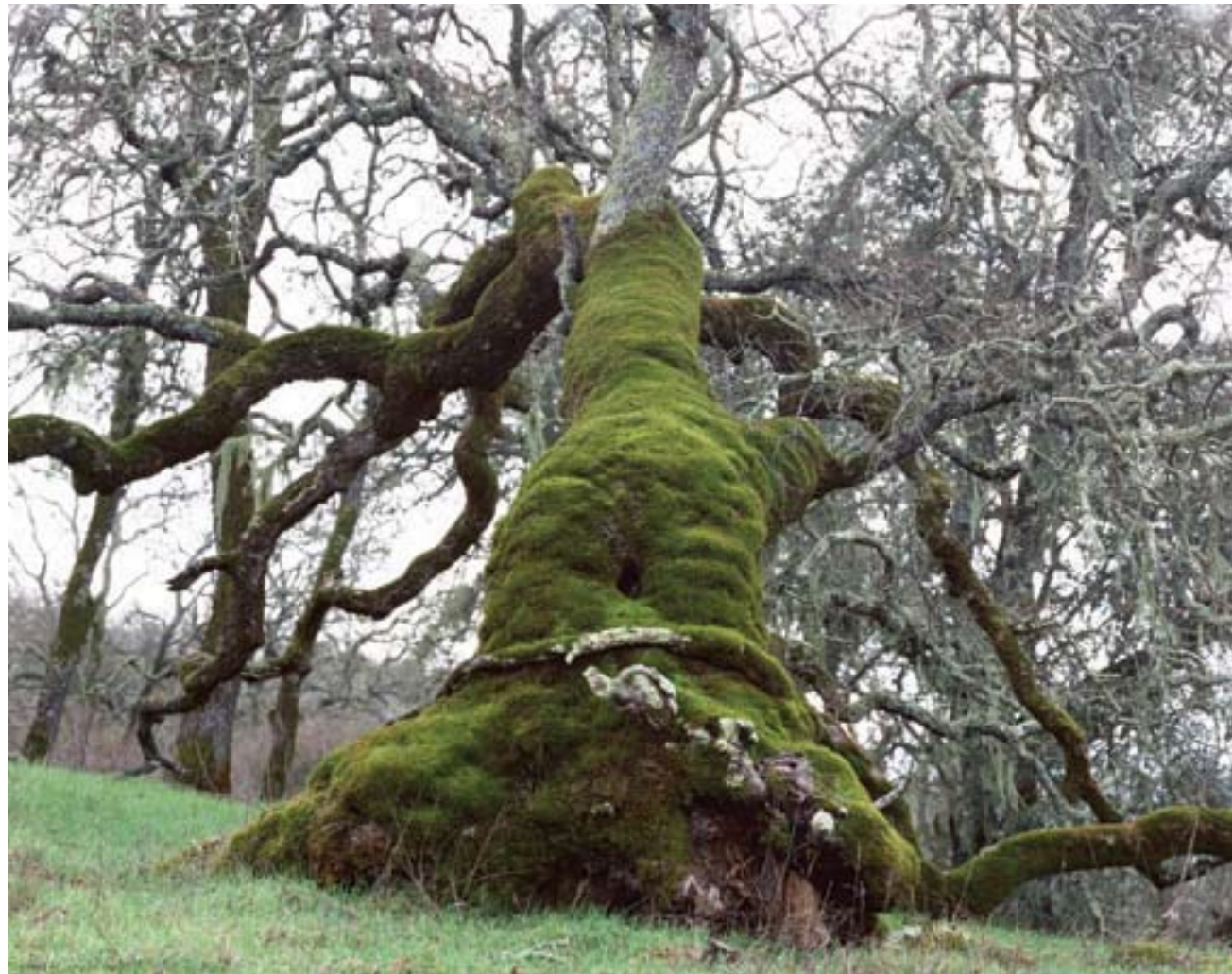
At Daylight the Miserable Man Was Carried to an Oak

2002 60" x 75" Ektachrome print Unique print