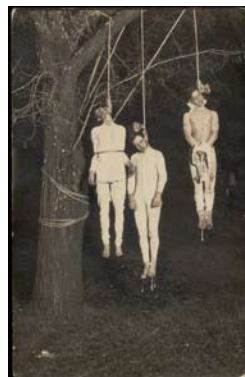
Photographer Unknown Santa Rosa Triple Lynching , 1920, Gelatin Silver Print mounted on postcard stock, 5" x 3 1/2", Collection of the Artist

It would be bourgeois reaction to negate the reification of the cinema in the name of the ego, and it would border on anarchism to revoke the reification of a great work of art in the spirit of immediate use-value...Both are torn halves of an integral freedom, to which however they do not add up. It would be romantic to sacrifice one to the other.